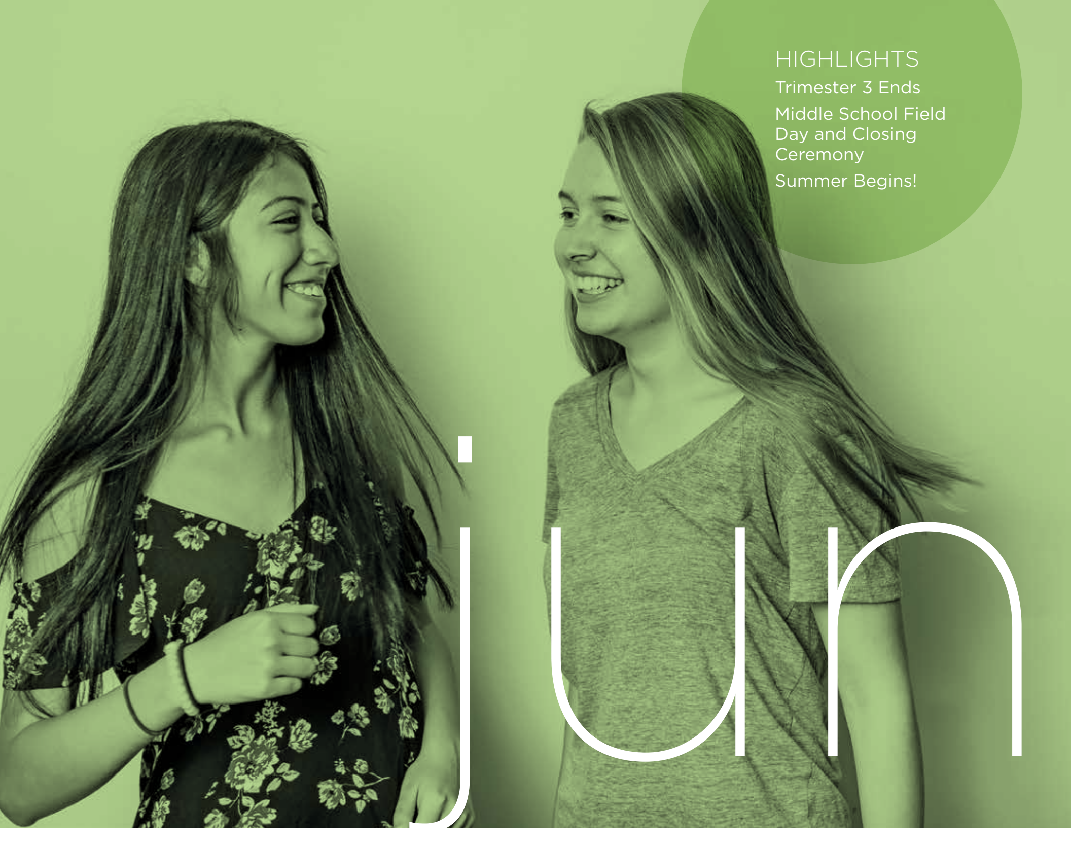
\textbf{NOTE} \ \ \text{Find the summer reading and coursework list at www.williston.com/summer-coursework.}