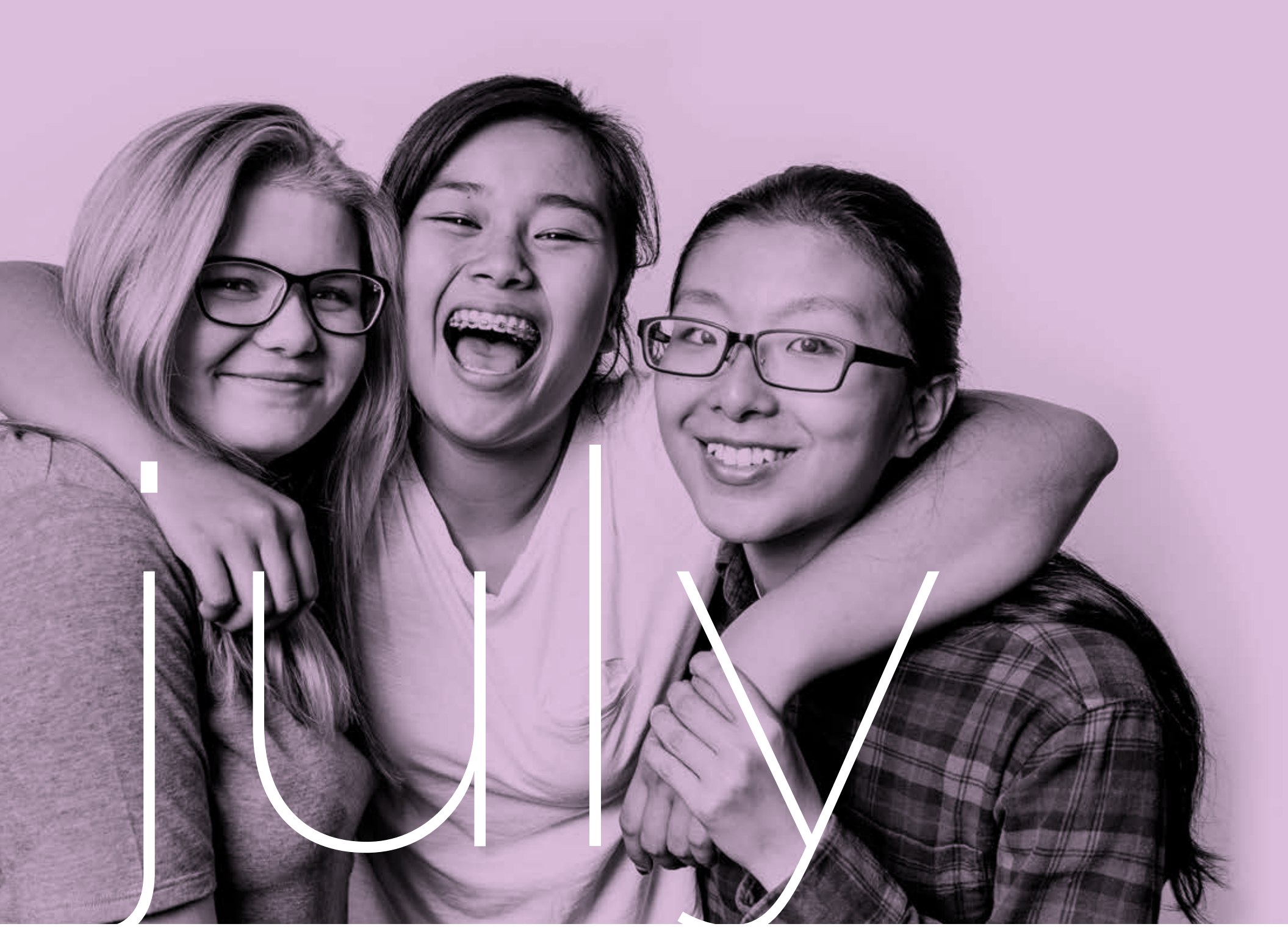
\textbf{NOTE} \ \ \text{Find the summer reading and coursework list at www.williston.com/summer-coursework.}