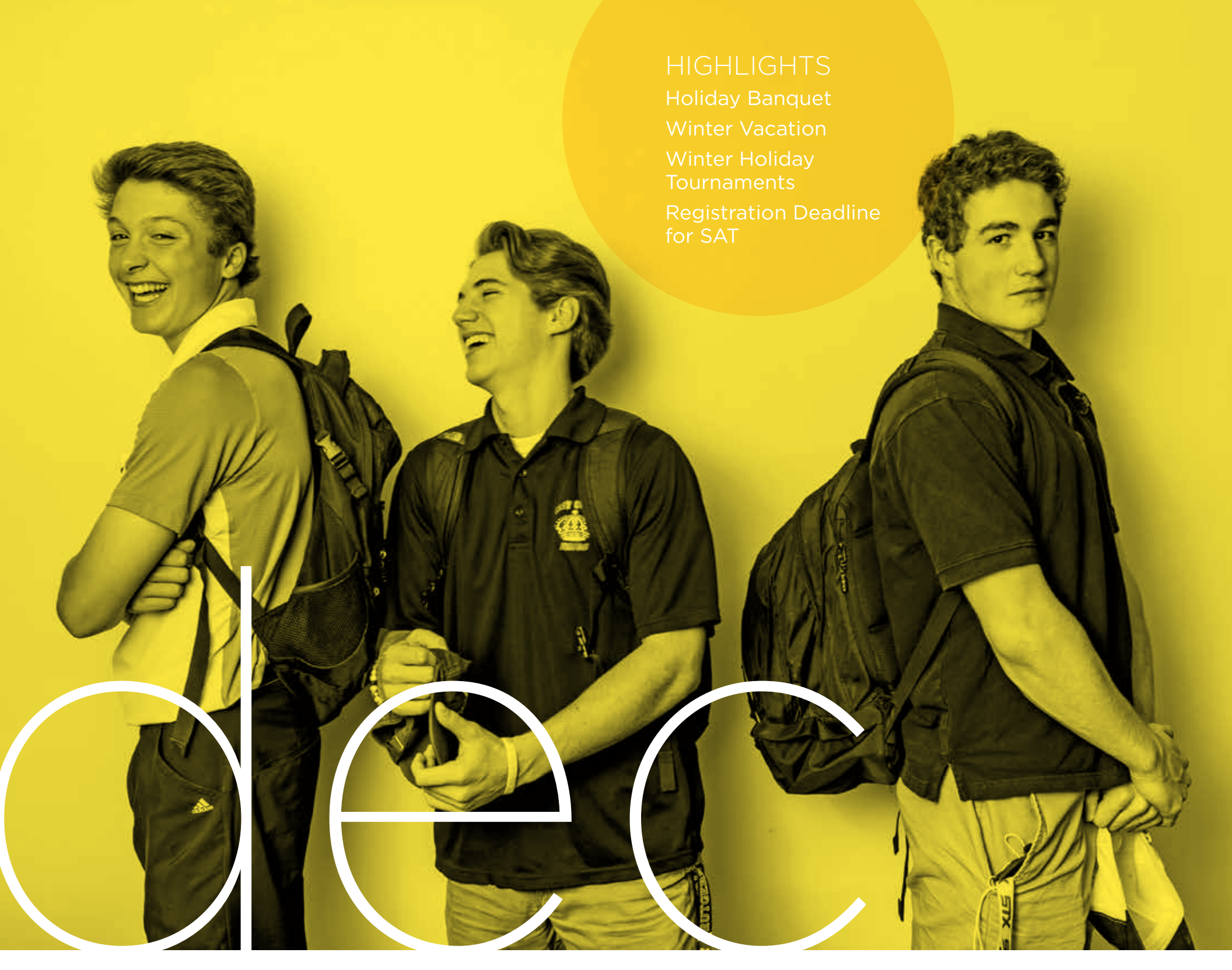
NOTE Green sheets are due to the Deans Office by 10:50 a.m. every Thursday. Weekend permission forms via email or phone are due every Friday by 2 p.m. from the supervising adult.