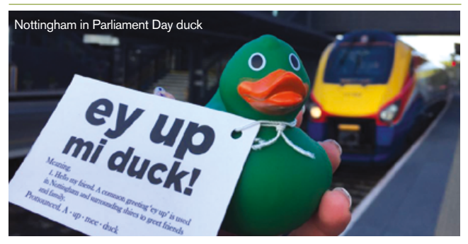
You can find pictures from the day on the NIPD website here.

'NIPD' branded ping pong balls were brought into Parliament by Table Tennis England