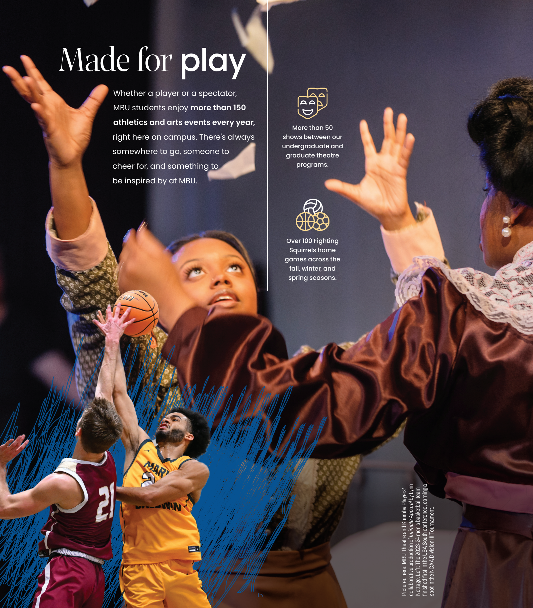
Pictured here: MBU Theatre and Kuumba Players' collaborative production of Intimate Apparel by Lynn Nottage. Left: The 2023-24 men's basketball team finished first in the USA South conference, earning a spot in the NCAA Division III Tournament.

Over 100 Fighting Squirrels home games across the fall, winter, and spring seasons.