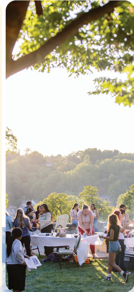
Unplug and reconnect at First Friday Fires.