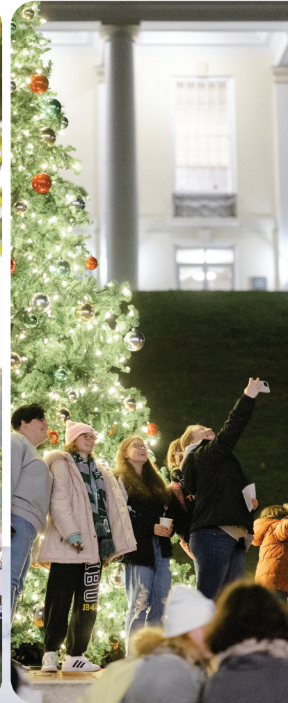
Celebrate with traditions old and new.