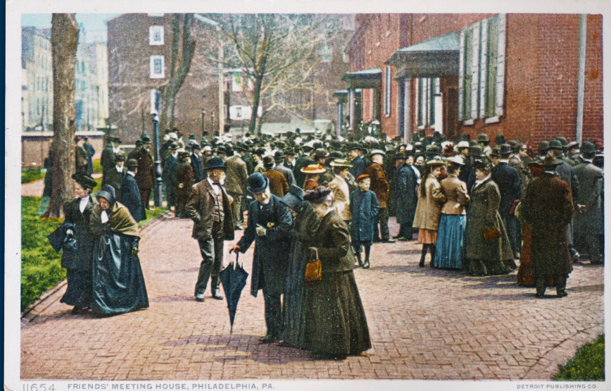
FRONT COVER: Sexta Costumes, 1885 (background) and Ancient Learning Tools, 1830-1890 ABOVE: Friends Meeting House Postcard, 1906 BACK COVER: Peace Quilt, 2001 BACK FLAP: Girls Basketball Sweatshirt, 1987-88, and 100th PC vs. GA Game Ball, 1986

History Revealed: Treasures from the Archives of William Penn Charter School celebrates the history of the school founded by William Penn and the Religious Society of Friends as told through objects, artifacts and memorabilia. Faculty, staff and Overseers, inspired by the 325th anniversary of Penn Charter, identified objects from archives, personal collections and even from the classrooms of the School. Artistically photographed and carefully researched, these objects create a diverse historical portrait of the School and the people and events that shaped it and were shaped by it. The hope is that this collection will inspire ongoing connections to the legacy of the world's oldest Friends school.