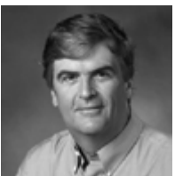
Pope "Mac" McCorkle Public Policy 24 posts