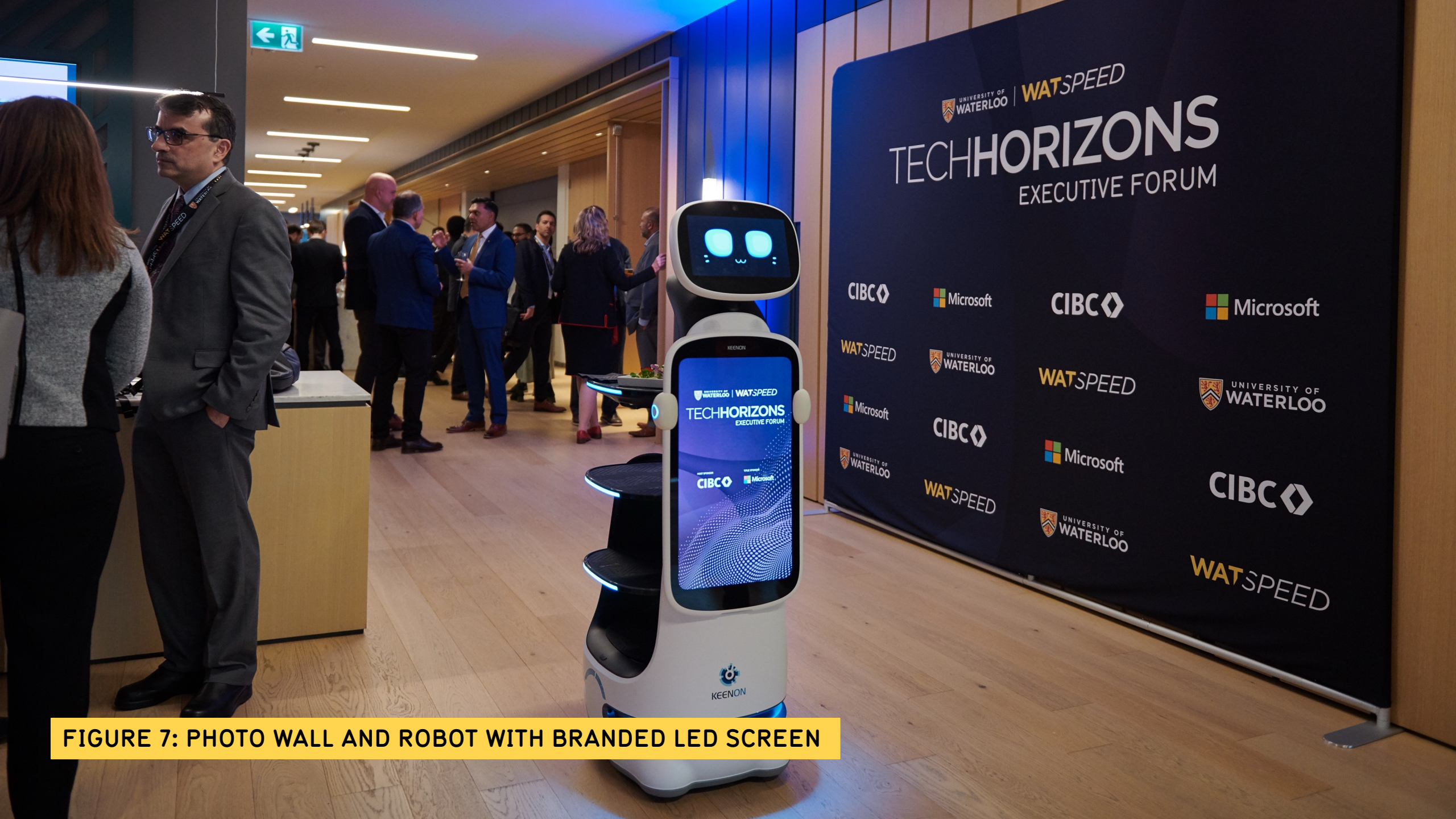
FIGURE 7: PHOTO WALL AND ROBOT WITH BRANDED LED SCREEN