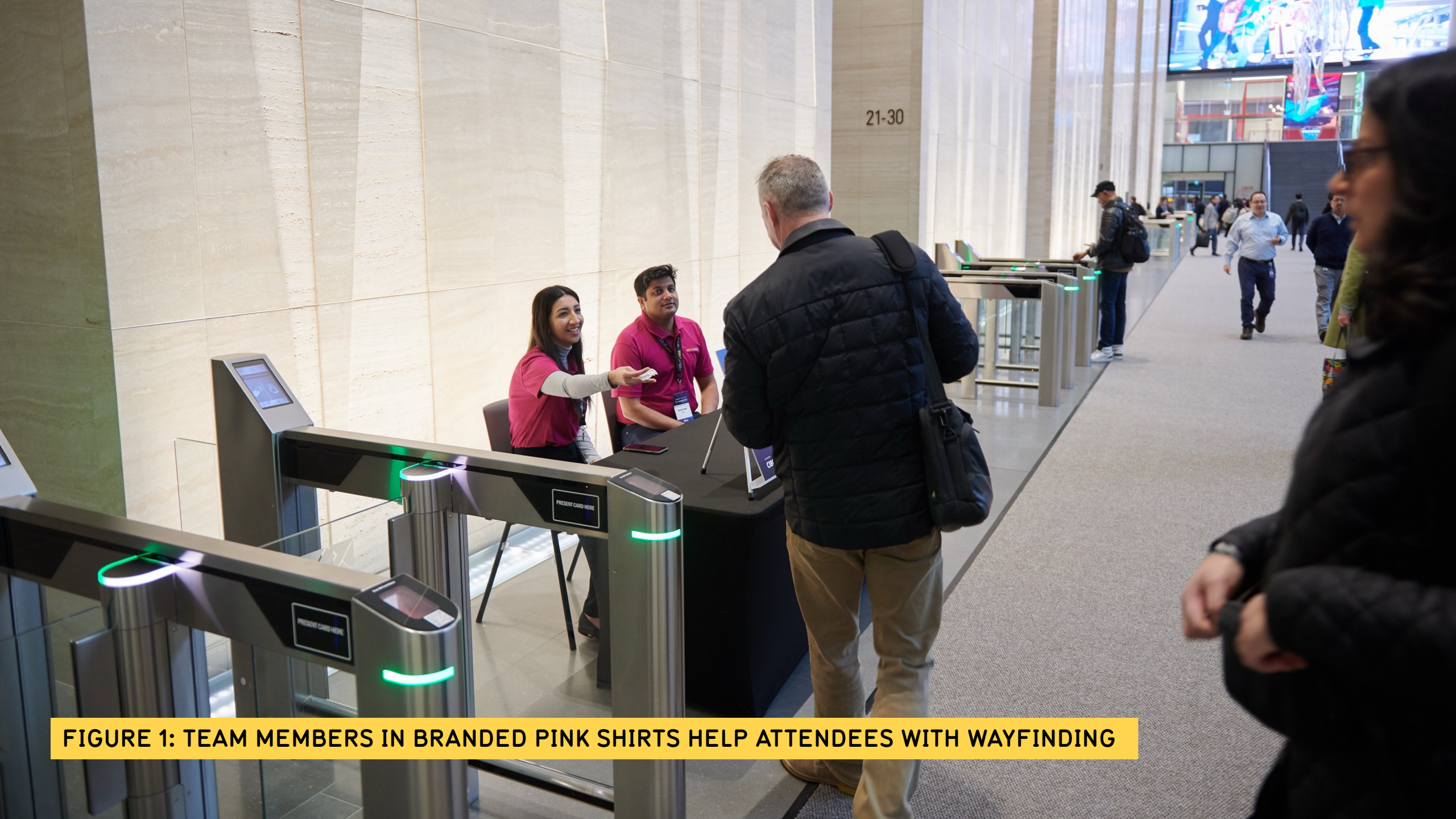
FIGURE 1: TEAM MEMBERS IN BRANDED PINK SHIRTS HELP ATTENDEES WITH WAYFINDING