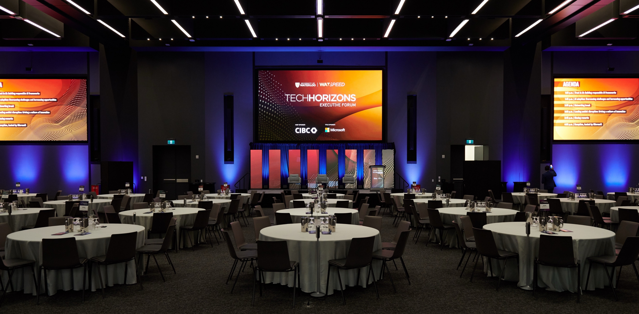
FIGURE 2: ROOM SETUP, STAGE VISUALS, AND DIGITAL SCREENS PRIOR TO ATTENDEE ARRIVAL