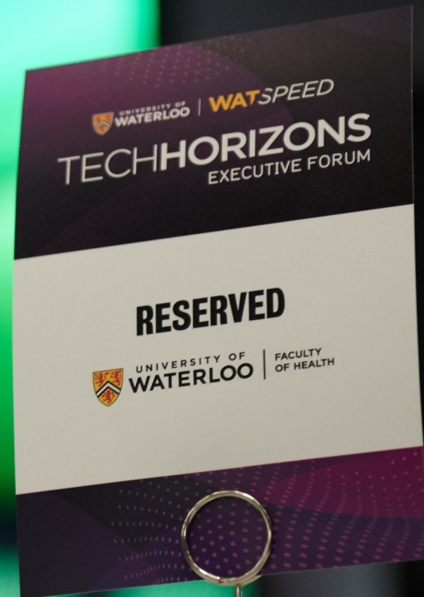
FIGURE 6: RESERVED TABLE SIGNS HELP ATTENDEES FIND THEIR SEATS IN THE EVENT SPACE