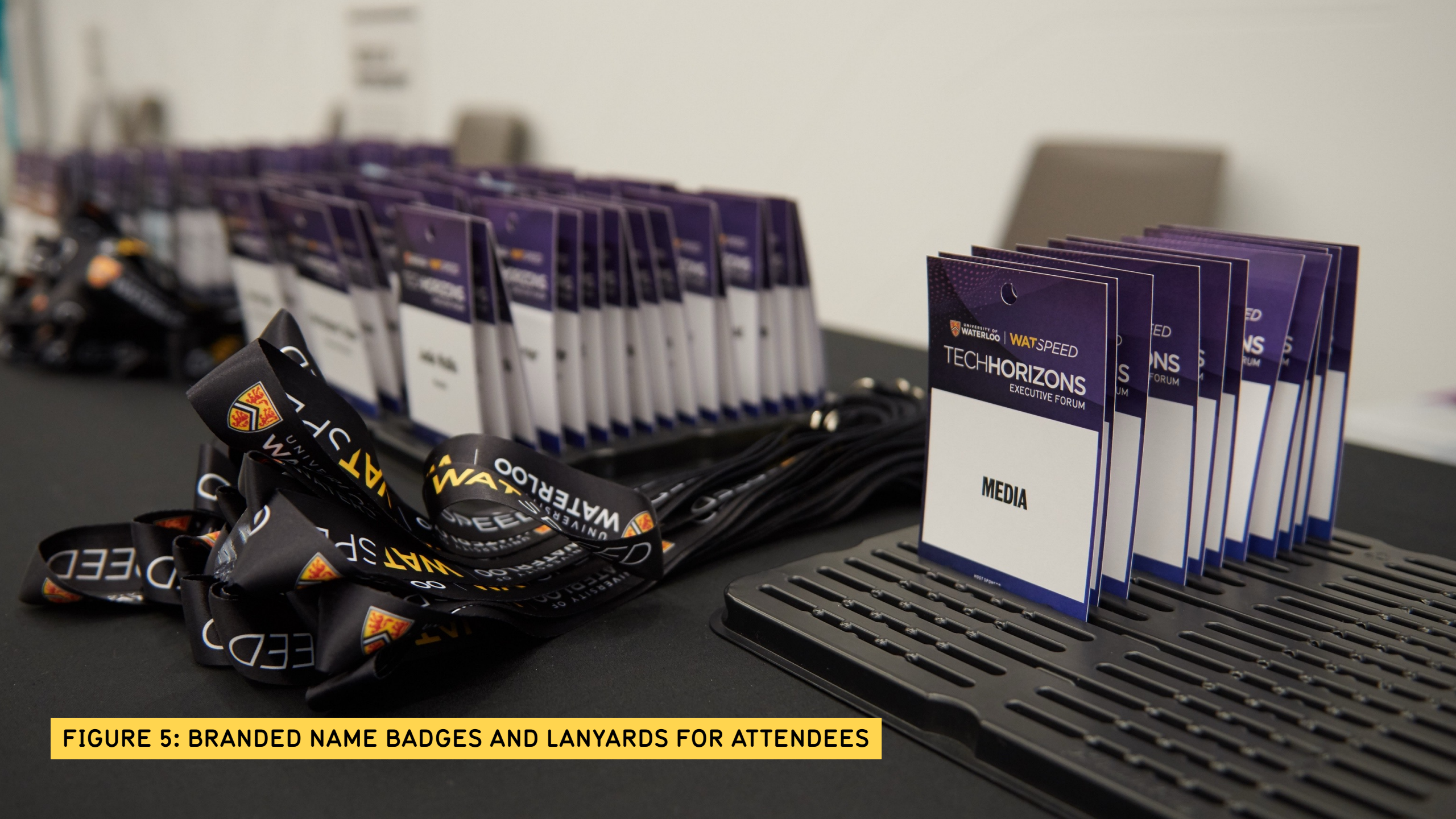
FIGURE 5: BRANDED NAME BADGES AND LANYARDS FOR ATTENDEES