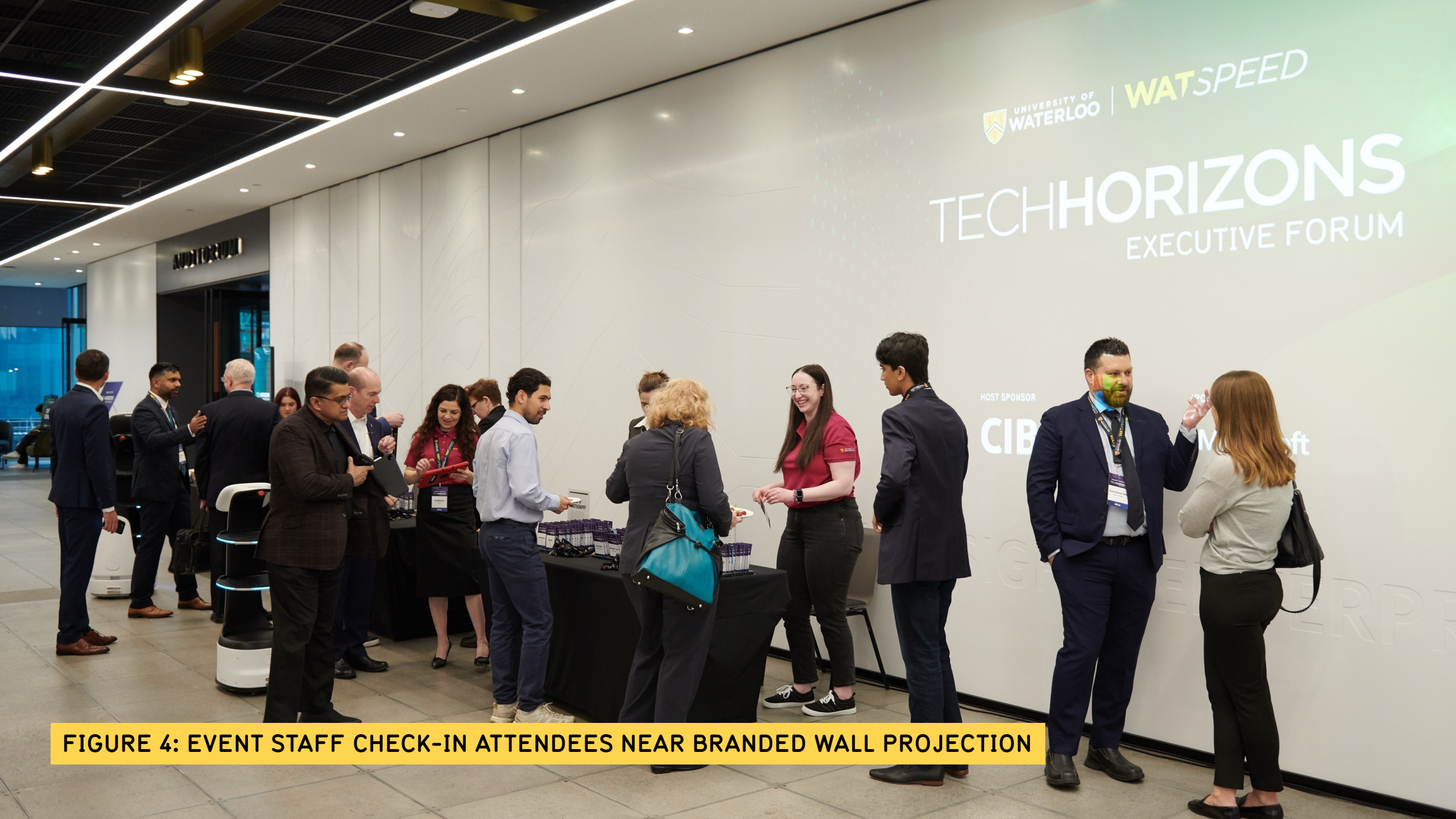
FIGURE 4: EVENT STAFF CHECK-IN ATTENDEES NEAR BRANDED WALL PROJECTION